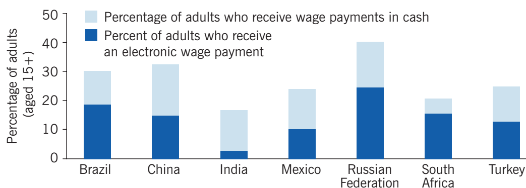
Figure 1. Private sector wage payments, 2014

Note: The total height of the bar is the percentage of adults who receive a private wage payment.