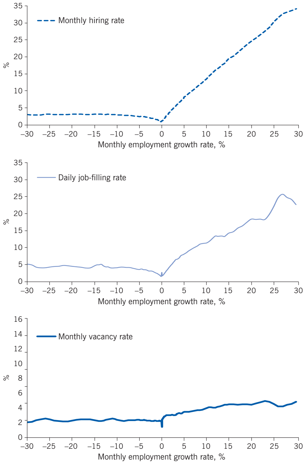
Figure 2. Hires, vacancies, and job-filling by employer growth

Note: The hiring rate refers to total hires during the month as a percentage of establishment employment. The vacancy rate refers to total vacancies open at the beginning of the month as a percentage of employment. And the job-filling rate refers to the average fraction of vacancies filled per day.